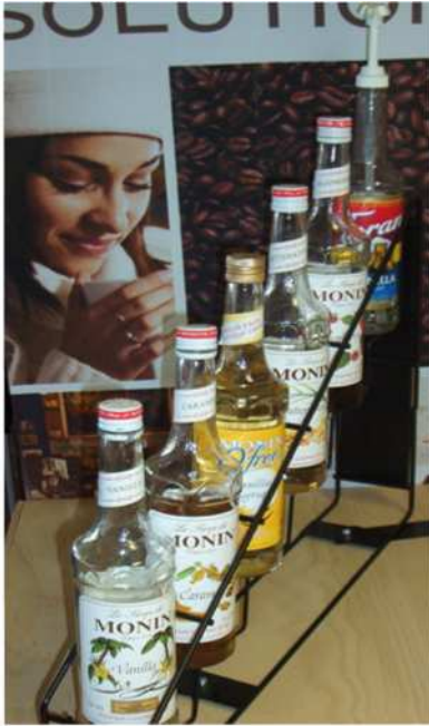
RACK6 - Syrup Rack